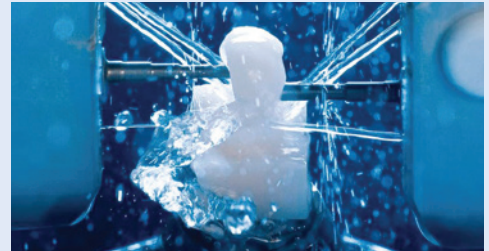
Our state-of-the-art milling machine can make your new crown while you wait!

Once Richard's book is full, with no physical room or appetite to expand the building, we will likely have to close our book to new patients. So if you wish to be a patient with us in the future, then now is probably the time to join! We are therefore pleased to enclose a voucher below giving the bearer a £30 credit towards future treatment for new patients.